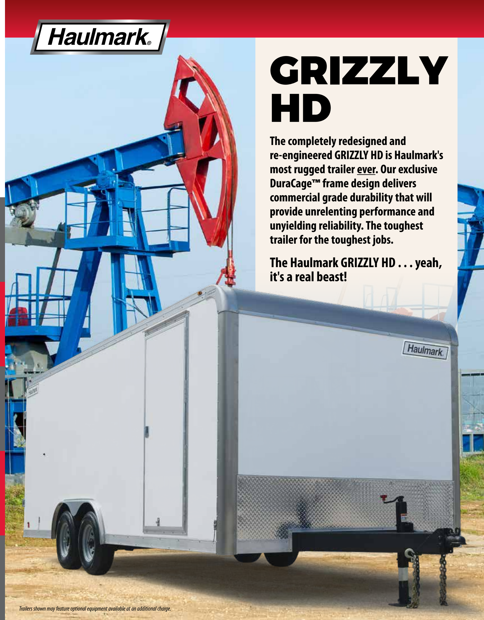
Trailers shown may feature optional equipment available at an additional charge.