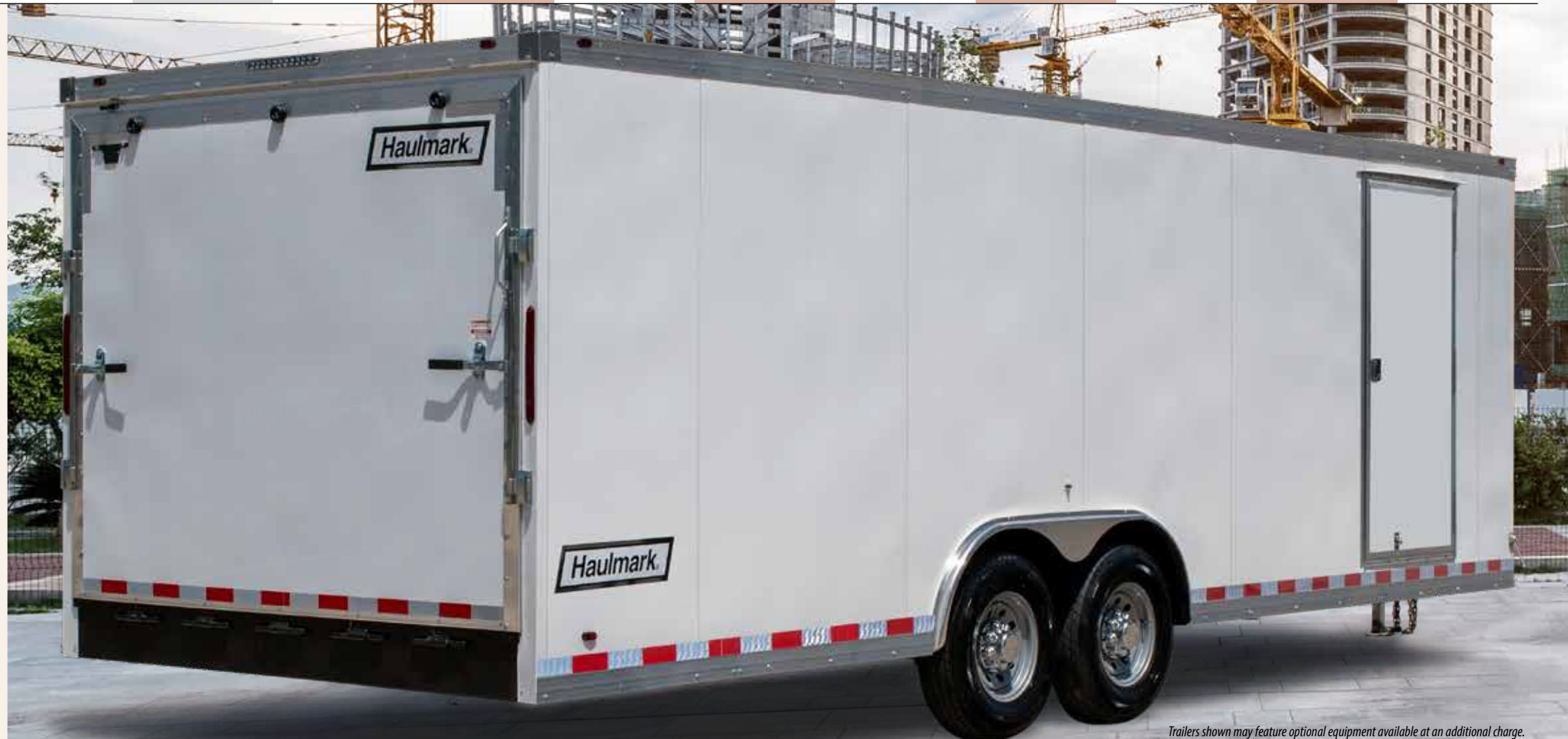
Trailers shown may feature optional equipment available at an additional charge.