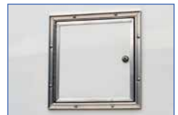
Locking Fuel Doors (2)