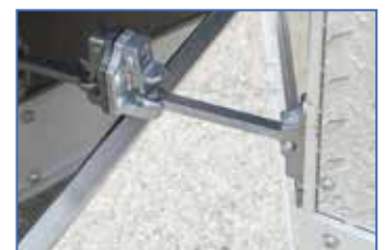
Cast Aluminum Door Hold Backs