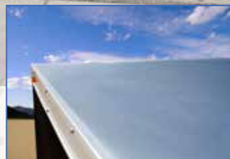
Innovative "Overlock" Roof Design — Screwless and Seamless